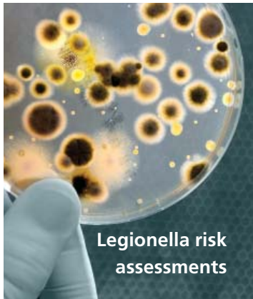
Legionella risk assessments