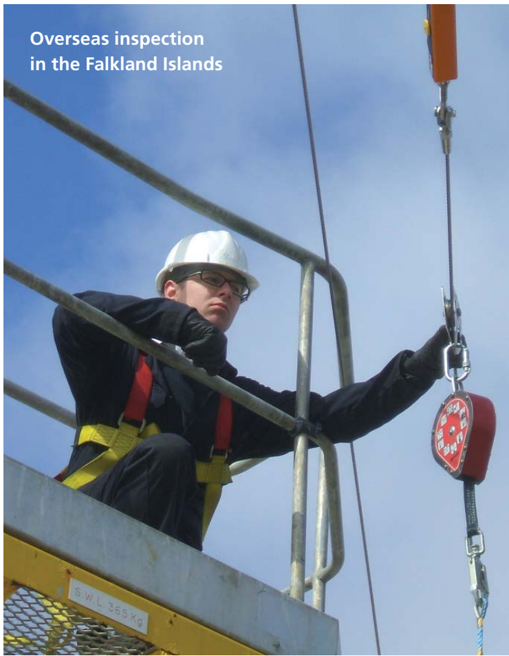
Overseas inspection in the Falkland Islands