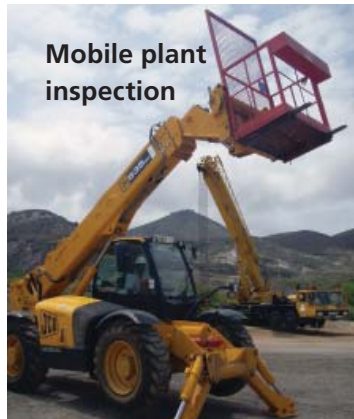
Mobile plant inspection